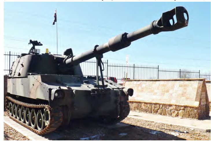
VFW 5181 Dove Creek is the proud owner of a M109, American-made self-propelled howitzer, first introduced in the early 1960s. The M109 can carry a crew of six; the section chief, the driver, the gunner, the assistant gunner and two ammunition handlers. The M109 is on display in front of their Post Home in Dove Creek next to a Veterans Memorial that has names of veterans from Dolores County that have has lost their life serving their country. Names can be added in the future if needed. Everyone is welcome to stop at the Post Home in Dove Creek.