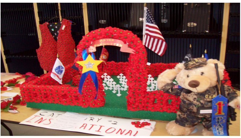
1st Place, Memorial or Inspirational, Delta VFW #3571 and Ladies Auxiliary. Cemetary with all Service, POW/MIA and U.S. flags with "Never Forgotten" and Bear guard.