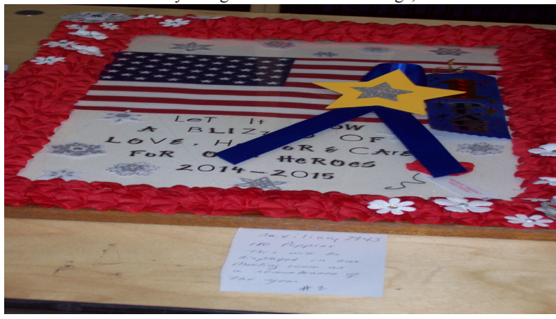
1st Place, Artistic and Decorative use of Poppies, Thornton VFW Post #7945 and Ladies Auxiliary. Flag with President Theme.