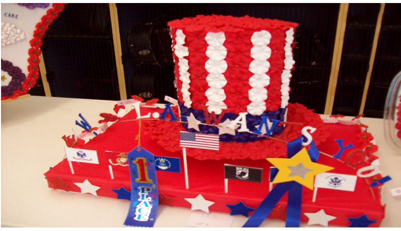
1st Place, Public Promotion, Golden VFW #4171 and Ladies Auxiliary. All American Hat with VFWLA Golden wants you sign with all 5 service flags, US and POW/MIA Flag.