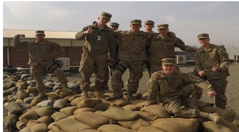
Monument VFW 7829 Auxiliary supports, with care packages, a troop in Afghanistan. They said "Thank you so much for supporting us while we are here! It is organizations like yours that make our job worth doing. Thank you for being true Americans and showing that we are not forgotten! We had just finished filling sand bags to use to build a fighting position on our base when the picture was taken".