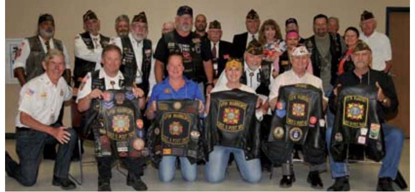
VFW Warriors at State Convention June 2016