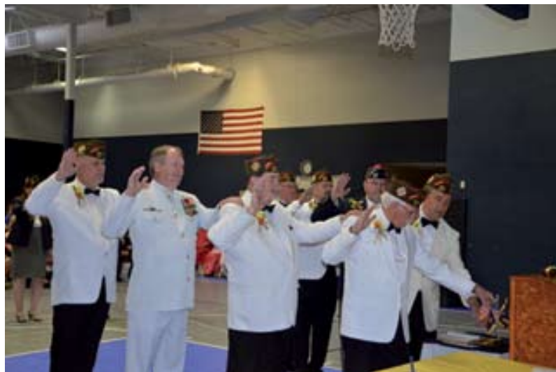
Department VFW Line Officers take their Oath of Office at State Convention Installation June 2016.