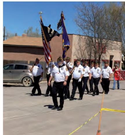
May 6, 2017 Department of Colorado VFW Loyalty Day Parade Calhan, CO