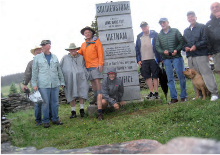
Twelve members of VFW Post 10721 braved the rain and hail to visit the “Vietnam Soldier Stone Memorial” near the Continental Divide at Sergeant’s Mesa, CO. We suggest all Colorado VFW Post members make this trip - you will have never seen anything like this in a war memorial on a mountain top.