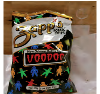
Welcome to the 113th National Convention in New Orleans, LA. There was plenty of food, snacks and fun to be enjoyed by all the Delegation. There was also meeting time, which they all attended!!