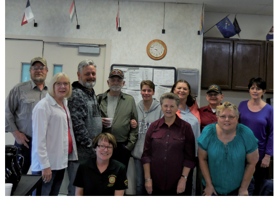
VA Pueblo CLC veterans received quilts from Quiltmakers. Post and Auxiliary #5812 Pueblo members helped out giving cake and ice cream to the veterans.