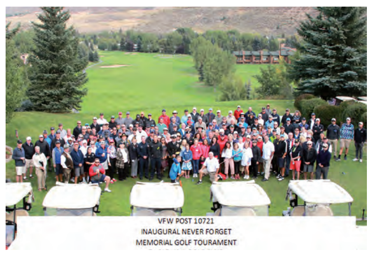
VFW Post 10721, 911 inaugural "Never Forget" Memorial Golf Tournament was a success & earned over $35,000 towards six high school and college scholarships.