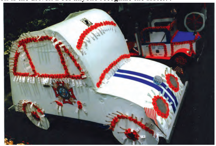
VFW Post 1247 Grand Junction built this Buddy Poppy Car for the Races.