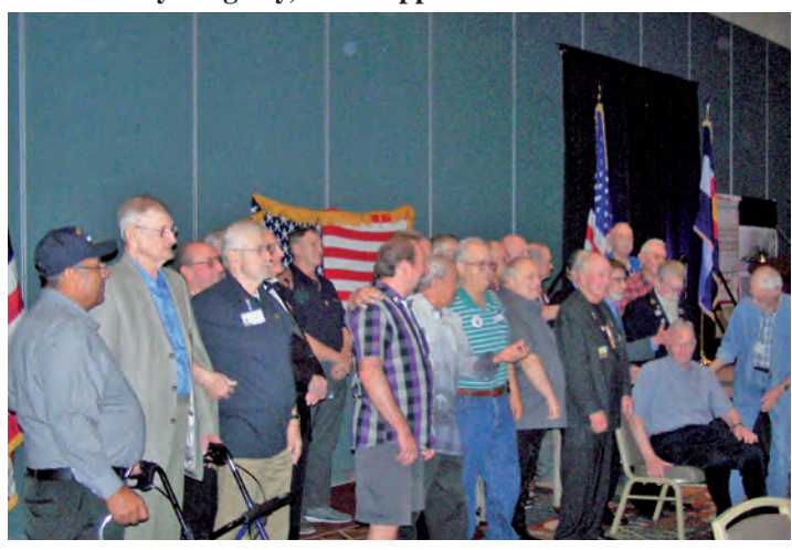
USS Pueblo 50th Reunion was held in Pueblo at the Marriott Hotel. The USS Pueblo was a small spy ship - 83 crew members - sailing off the coast of North Korea on a wintry Jan. 23, 1968, eavesdropping on North Korea radio traffic.