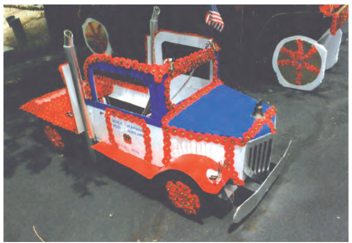
Verle Huffman VFW Post 9644 and Auxiliary built a truck for the Races.