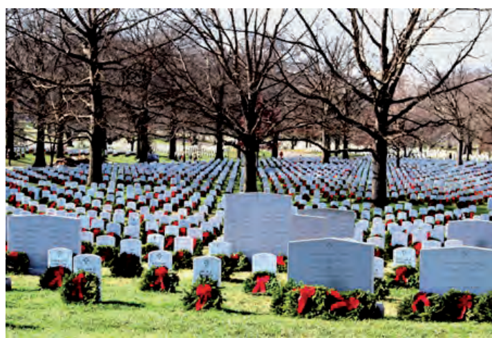
Each December on National Wreaths Across America Day, our mission to Remember, Honor and Teach is carried out by coordinating wreath-laying ceremonies at Arlington National Cemetery, as well as over 1,200 additional locations in all 50 U.S. states, at sea, and abroad. December 15, 2018, Fort Logan Cemetery will also be observing Wreaths Across America Day and wreaths will be placed on veterans' graves throughout the cemetery.