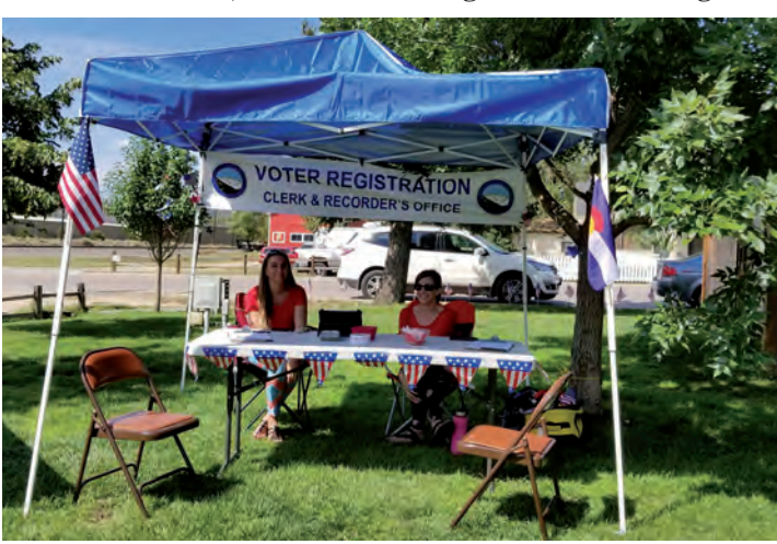
Monument Family Freedom Festival for Colorado Veterans, El Paso County Voter Registration Officer were on hand to register voters and answer registration question. Festival was held in September 2018.