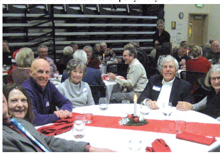
Minturn VFW Post 10721 hosted the annual Christmas Party at the Edwards Colorado Mt. College to a crowd of over 80 attendees. Taste 5 Catering provided dinner and "The Fabulous Femmes", had the party dancing, singing and partiing to Christmas favorites.