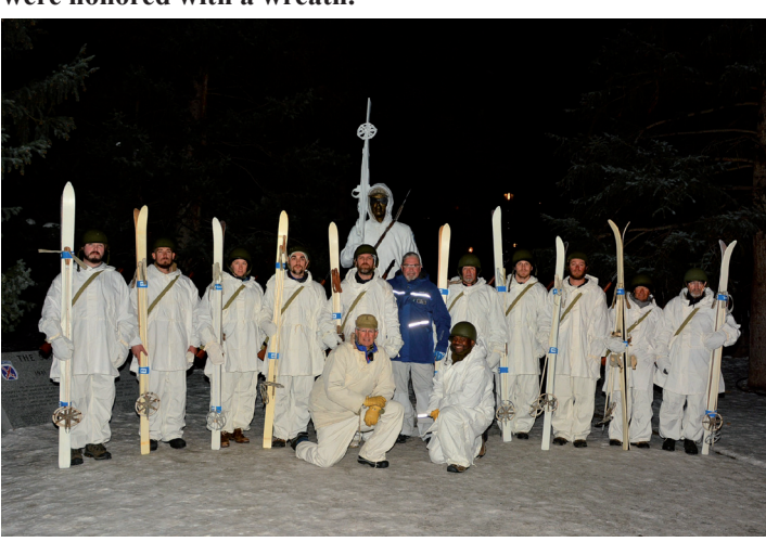
Minturn Mt Holy Cross VFW Post 10721 members spent time in the Vail Colorado Snowsports Museum. The 10th Mountain Div. Torchlight Ski Down and Legacy Parade in Vail brings history to life and pays homage to the founders of Vail.