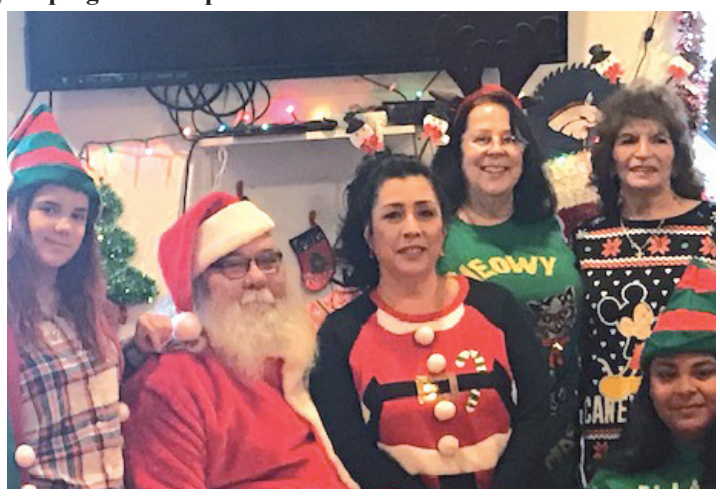
Santa Claus dropped in for the Commerce City VFW Post 4444 and Auxiliary Christmas Party and the Auxiliary 4444 Elves were there to help him with the gifts. Then he was back on sled to another party. Busy man