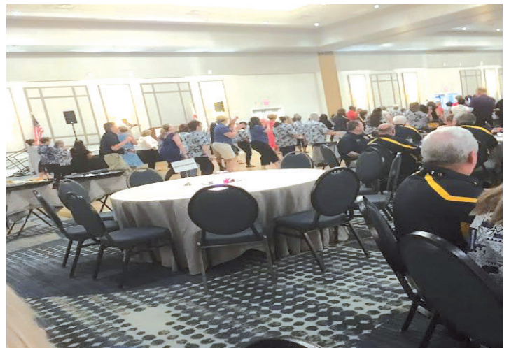
National Reception Wednesday July 24th, Orlando FL. It is almost time to return home and all the meetings and parties are over. VFW members and VFW Auxiliary members attend and Congratulate the new National Officers.