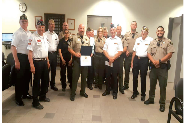
Western Slope VFW Post 3981 recognizes a Mesa County Deputy Sheriff each quarter with a Certificate of Appreciation and a gift certificate for dinner at a local restaurant.