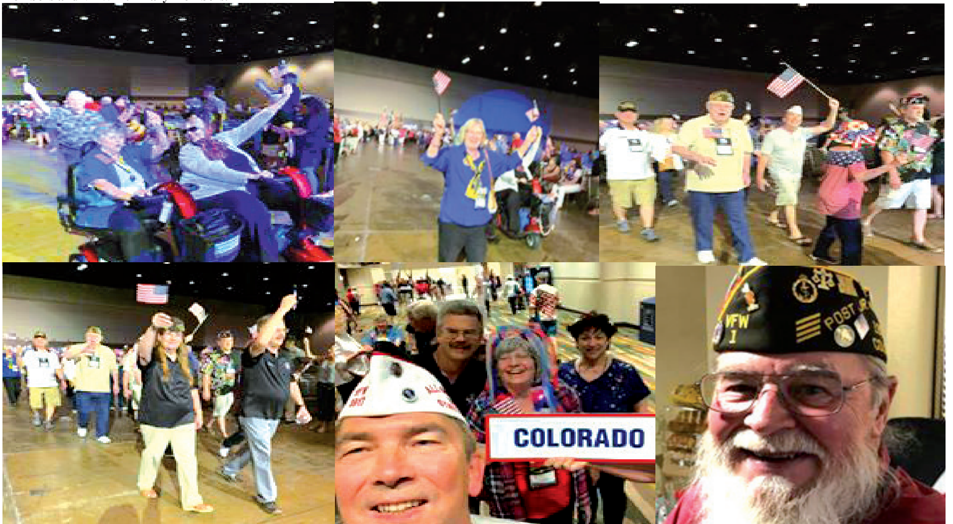
National Convention Patriotic Rally, it is Parade time.