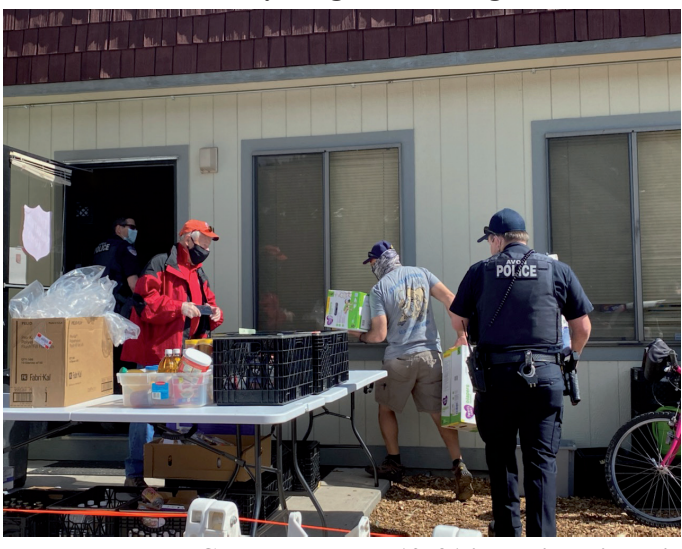
Veterans from the Mt Holy Cross VFW Post 10721 in conjunction with Avon and Vail Police Departments delivered much needed food items to the Salvation Army on Tuesday from Wal-Mart. Post members raised over $2,000 for the products.