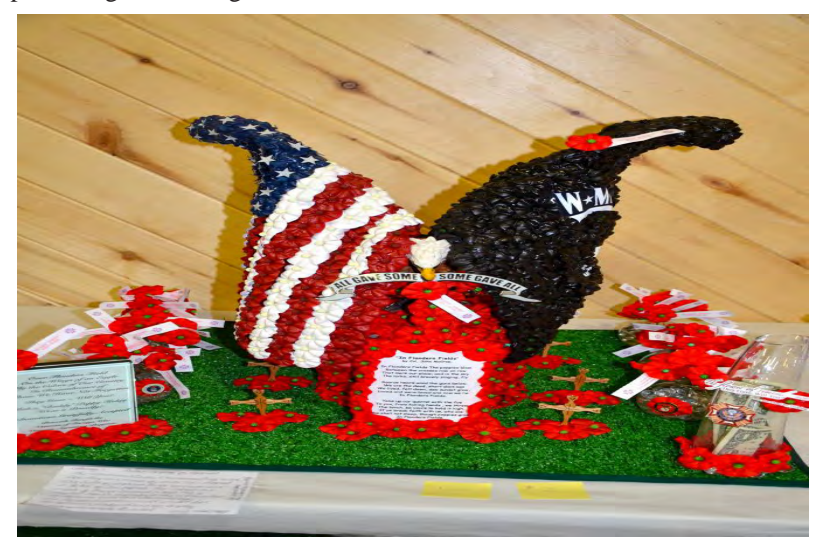
Department Convention Public Promotion 1st Place Buddy Poppy Display Winner, Montrose, CO. Eagle with over 1,000 Buddy Poppies. Pueblo West #5812 and Auxiliaries. Display was taken to National Convention in St. Louis, MO and took 1st Place in Category I Public Promotion.