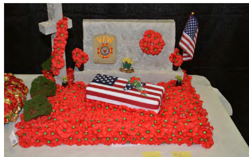
Department Convention Memorial 1st Place Buddy Poppy Display Winner, Montrose, CO. Flag draped coffin in a field of Buddy Poppies. Assembled by VFW Post #2551 Fort Morgan and Ladies Auxiliary. Display was taken to National Convention in St. Louis, MO