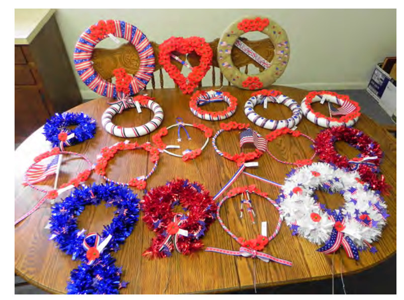
Kit Carson Ladies Auxiliary #3411 did a project of Buddy Poppy wreaths for Memorial Day. Some were made with coat hangers, padded with plastic bags and covered with ribbon and then the poppies. After taking the picure there were some that they made changes too. They also had requests for red, white and blue ones so made more to honor those requests. Left over ones were placed on veterans graves that had nothing.