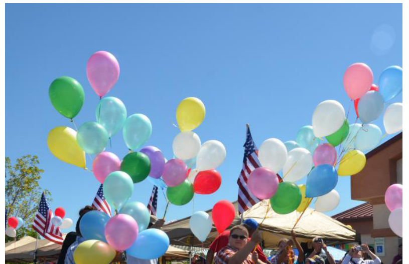
Pueblo "All Patients Day" Balloon Launch, September 13th. VFW, Ladies Auxiliary, MOC and MOCA, and members maintained booths and gave out goodies to Resident Veterans. Always a good time, plan on going next year, if you have never attended.