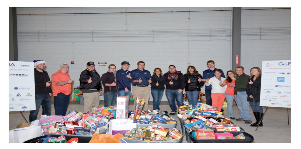
Commander's Special Project 2015