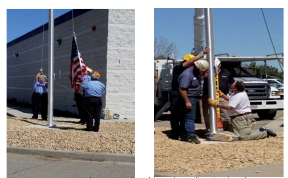
Tri-Town VFW Post 9741 is also a member of the Carbon Valley Chamber of Commerce and April 2016 at their after-hours meeting they donated an American flag as a door prize. It was won by Swingle Lawn, tree and landscape care in Firestone. Since they had no place to fly it they asked if we could help them secure a flagpole. Not only were we able to do this but the post also installed the concrete base and when it came time, the pole itself. When we did raise the flag on Thursday May 12th members of Swingle, the community, Carbon Valley Chamber of Commerce and of course members of Post 9741 were in attendance for the occasion.