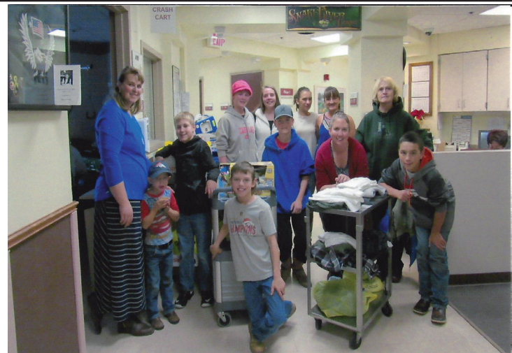
Harold "Huck" Hensley VFW Auxiliary #4334, Ault, CO., officers, members and families visiting Cheyenne VA Hospital.

Tickets may be purchased starting 10/31/17 - 12/3/17 www.vfwpost1.org or Contact admin@vfwpost1.org with questions