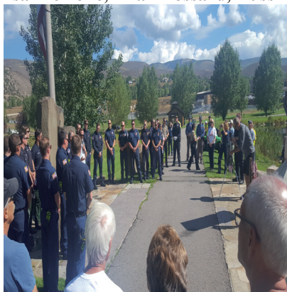
Eagle County Law Enforcement Agencies, Eagle River Fire District, VFW Post 10721 Minturn members, and Eagle County Paramedic Services paid tribute to all the fallen New York City first responders, military and civil service personnel in the Pentagon, and crew and passengers of American Airline Flights that were lost on September 11, 2001.