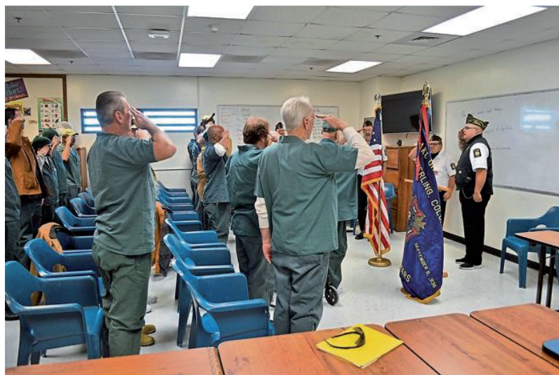
VFW Post 3541 Sterling includes inmates in Veterans Day celebration

2018 - 2019 Contest Themes Voice of Democracy “WHY MY VOTE MATTERS” Patriot's Pen “WHY I HONOR THE AMERICAN FLAG”