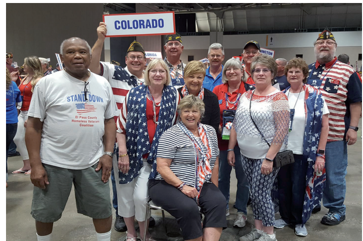
Department of Colorado VFW and VFW Auxiliary Officers and members attending the National Convention Patriotic Rally. All dressed up in Red, White and Blue and having fun.