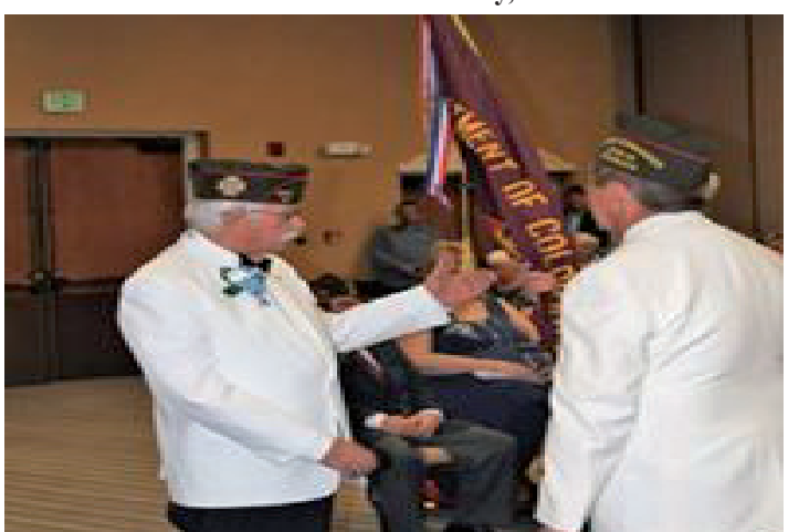
Department Color Guard will now case the Department Banner until the Department Convention June 2019. If your VFW Post would like to host the 2019 Convention, an application can be obtained by contacting Department Headquarters. All the requirements to host the Convention will be listed on the application. Takes a lot of advance planning and you need to start early to line up hotels, meeting rooms, meals, printing of convention book, registration, Golf Tournament and Military Banquet. Call 303-421-1630 for any further information and start planning.