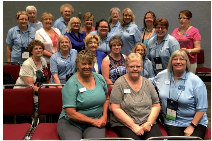
Department of Colorado VFW Auxiliary Officers and members attending National Convention in Kansas City, MO.