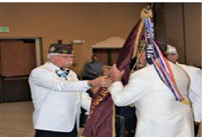
This is a tradition that is carried out at Department of Colorado Conventions every year during the Installation of Officers. Department Color Guard presents the Department Banner to the retiring Commander, who in turn, presents the Department Banner to the incoming Commander, who in turn, presents the Banner back to the Department Color Guard. The Banner is then cased until the next Department Convention. There is also a tradition to have the spouses or a friend cap the installed officers and the Department Commander is presented with his State Commander pin, which is passed from Commander to Commander every year.