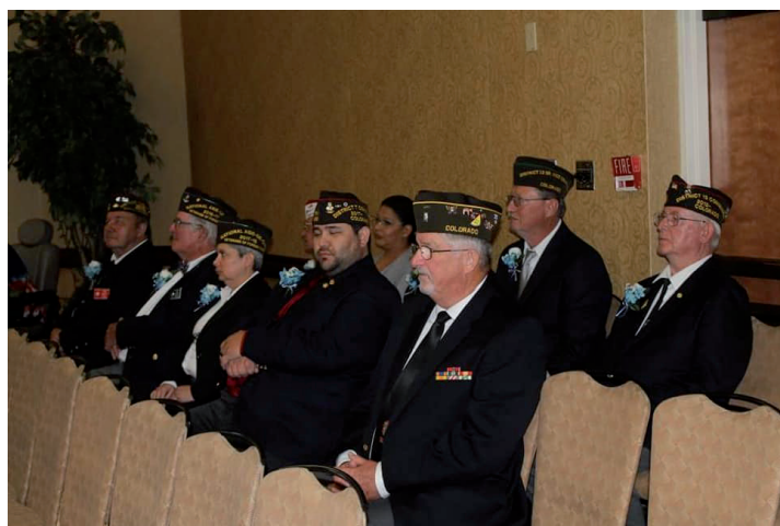
Department of Colorado District Commanders are ready to be installed at Department Convention held at the Ramada Plaza Inn, Northglenn, CO., June 16, They all were elected by their respective District in May and are officially installed at Department Convention in June every year. Their year does not start until the Department Commander is installed at State Convention. Now their year of traveling and helping the VFW Posts in their District begins. They will also attend Council of Administration meetings, and all are a part of the Council of Administration for the 2018-2019 year.