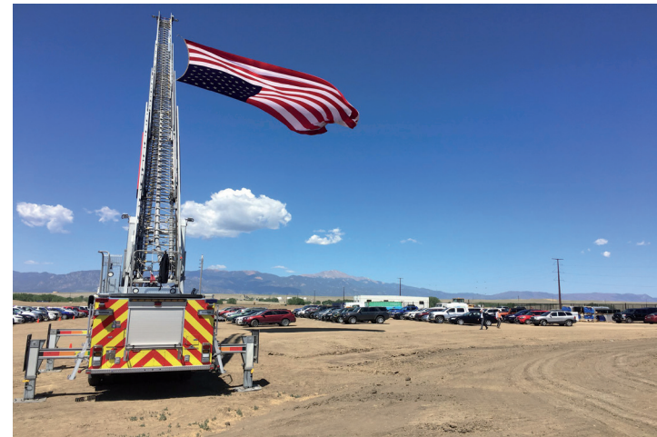
Colorado Springs Fire Department A-Shift from Truck 4 and 8 extended their trucks "stick" to display the United States of America National Flag at Pikes Peak National Cemetery.