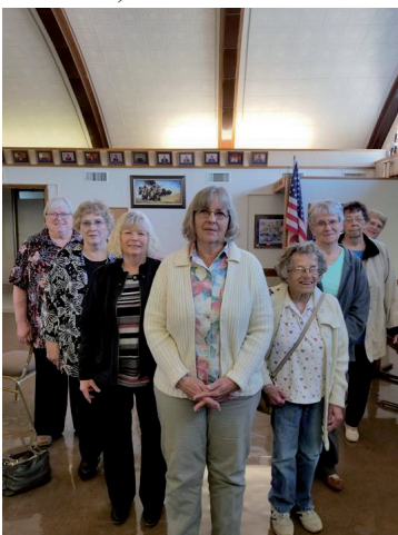
District 13 VFW Auxiliary Officers installation.