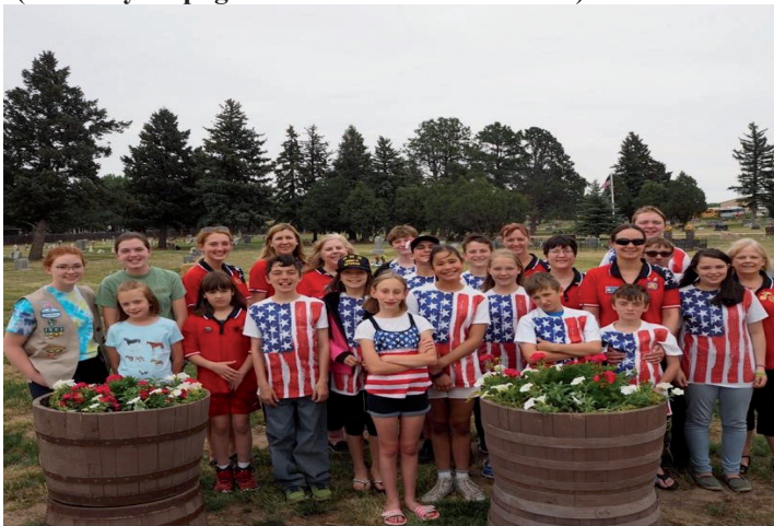
VFW Auxiliary 7829 Youth Group preparing to place flags on Veteran graves at the cemetery in Monument, 8 members, 17 kids.