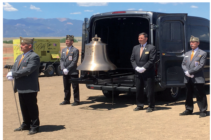
Honor Bell Guard at Pikes Peak Cemetery Dedication.

At interment ceremonies, the Honor Bell is guarded and tolled by the Bell Guard.