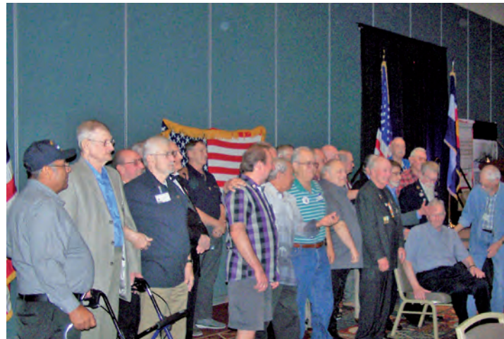
USS Pueblo 50th Reunion was held in Pueblo at the Marriott Hotel. The USS Pueblo was a small spy ship - 83 crew members - sailing off the coast of North Korea on a wintry Jan. 23, 1968, eavesdropping on North Korea radio traffic.