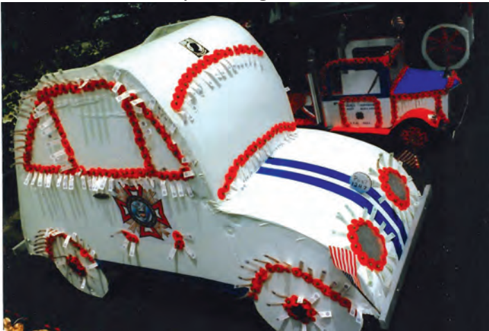
VFW Post 1247 Grand Junction built this Buddy Poppy Car for the Races.