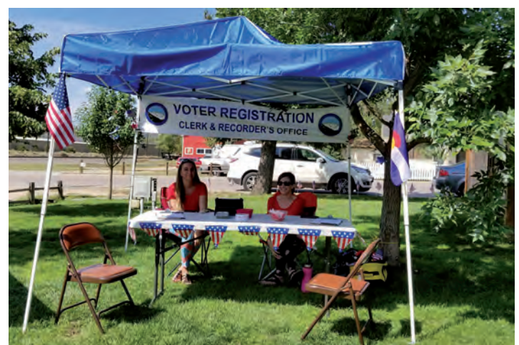
Monument Family Freedom Festival for Colorado Veterans, El Paso County Voter Registration Officer were on hand to register voters and answer registration question. Festival was held in September 2018.