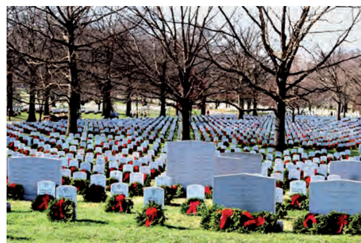
Each December on National Wreaths Across America Day, our mission to Remember, Honor and Teach is carried out by coordinating wreath-laying ceremonies at Arlington National Cemetery, as well as over 1,200 additional locations in all 50 U.S. states, at sea, and abroad. December 15, 2018, Fort Logan Cemetery will also be observing Wreaths Across America Day and wreaths will be placed on veterans' graves throughout the cemetery.