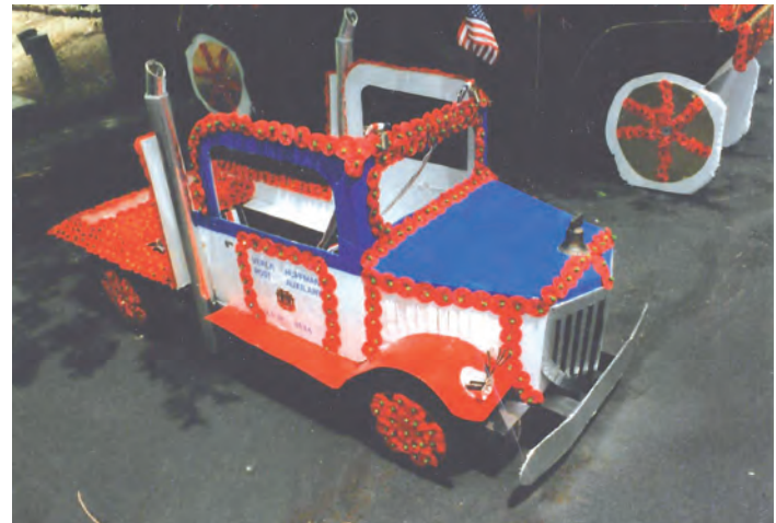
Verle Huffman VFW Post 9644 and Auxiliary built a truck for the Races.