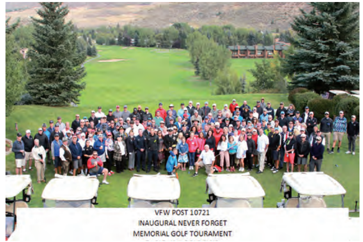
VFW Post 10721, 911 inaugural "Never Forget" Memorial Golf Tournament was a success & earned over $35,000 towards six high school and college scholarships.