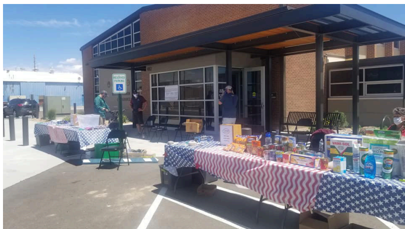
Western Slope VFW Post 3981 conducted a food drive in Grand Junction on Armed forces day, May 15th. Over 4,000 lbs of food and personal hygiene products were collected and will be distributed to Veterans on the Western Slope. The event was held at Western Region One Success. COVID-19 does not prevent the VFW from providing support to our fellow Veterans.

We are now in the 2021 Membership Year Please don't allow your dues to expire Become a Life member and never pay dues again