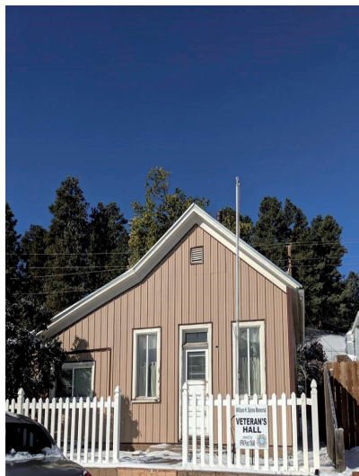
Elizabeth VFW Post 10649 Building has a new look. Thanks to all that have supported this project over the past year. It took some time to complete but you got it done! Thank You Home Depot for their grant for this project.