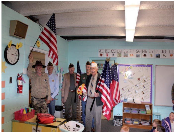
Cuerno Verde VFW Post 7305 Colorado City replaced worn out flags in schools. The local VFW chapter replaced the flag in the auditorium, the flags in 21 classrooms, and the large outdoor flag at Rye Elementary on November 21, 2019.