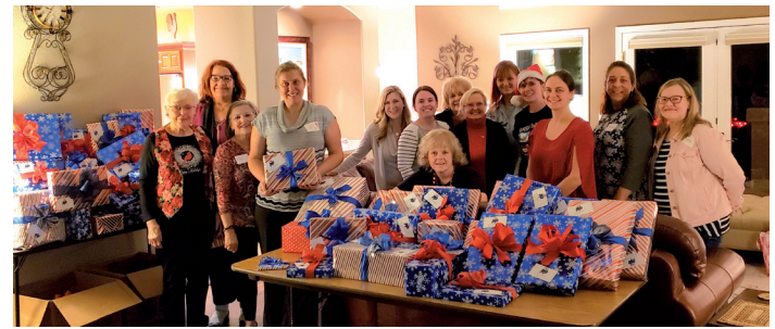
Monument VFW Auxiliary 7829 members wrap over 70 Christmas gifts for veterans who reside at the Pueblo VA Community Living Center, Laurel Manor Care Center in Colorado Springs, and Bethesda Gardens in Monument. For each of the past six years, VFW Post 7829 purchase the gifts, the Auxiliary wrap the gifts and a Christmas Party is held at each facility.