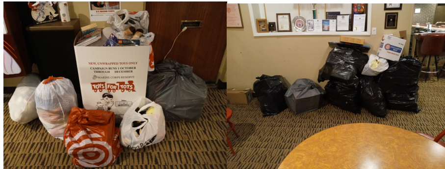
Englewood VFW Auxiliary #322 collected items for Toys for Tots. Donation boxes were at the Post and members brought in items.