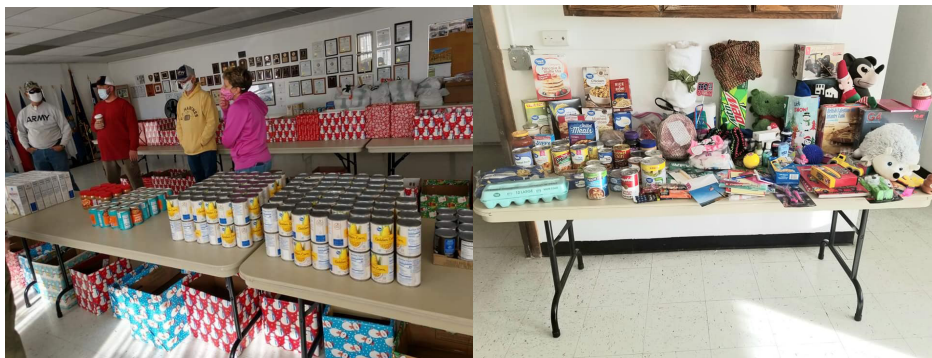
VFW Post #3981 Grand Junction and VFW Auxiliary packed over 75 boxes for delivery at Christmas time. One family of 4 received food and toys for the kids and a variety of books and games. Blankets and warm clothing was also provided for Veterans and their families, as needed.