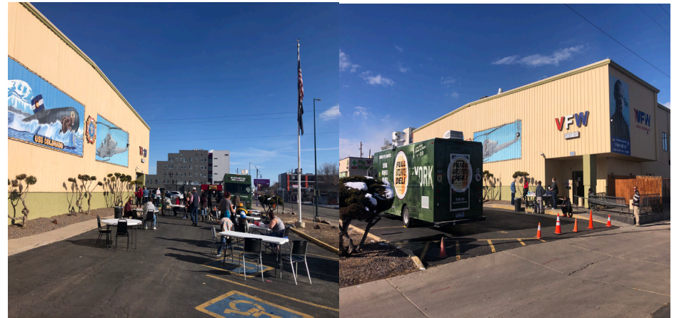
Parking Lot at VFW Post #501 was set up with tables for social distancing. Masks were required and guests were checked for temperature.