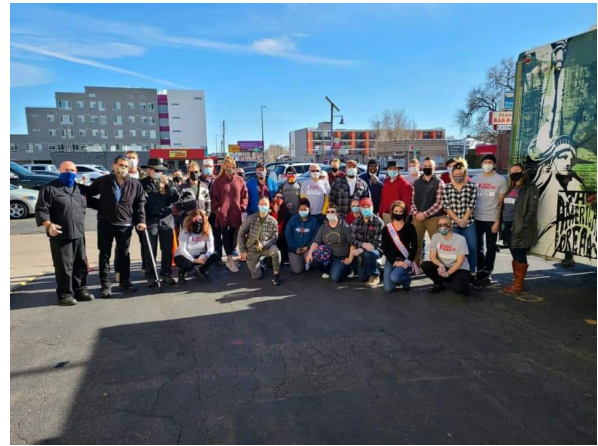
Francis Brown Lowry VFW Post #501 held a Thanksgiving Dinner on their Parking Lot for neighbors. John S Stewart VFW Post #1 had two Food Trucks parked on the Lot serving the food to anyone that wanted a meal to go.

We want to see our Posts reaching out to our members and working hard to show that we are an active and progressive organization that has 20/20 VISION FOR VETERANS!