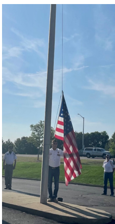
Longs Peak VFW Post 2601 Longmont, CO