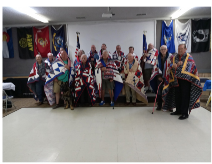
On Sunday Jun 1, 2023, VFW Auxiliary #322 held a Quilts of Valor event. A personalized quilt was presented to each of the 15 veterans. The quilts are made to honor and comfort each veteran for his or her military service.