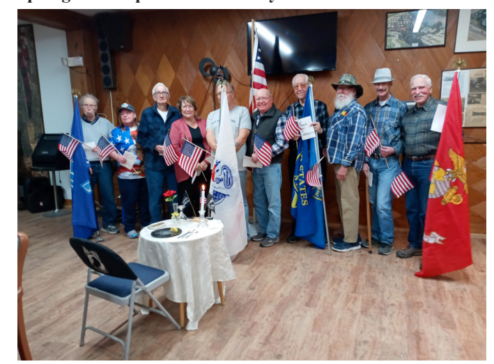
Englewood VFW Post #322 and VFW Auxiliary did a POW/MIA Missing Man Table Program at Wolhurst Mobile Home Park on November 12th with 10 Veterans present. They handed out 10 U S Flags and 26 Buddy Poppies.