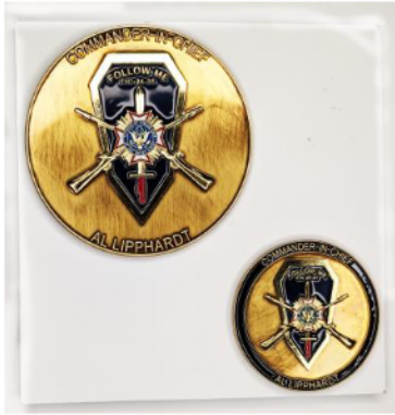
Commander-in-Chief Medallion and Coin

Below you will see examples of some of the awards and items mentioned in this program. For more information, contact the VFW Membership Department.