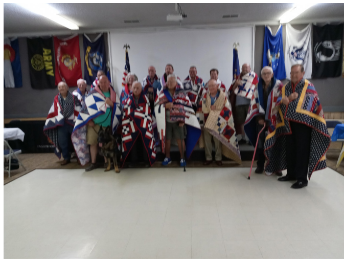
On Sunday Jun 1, 2023, VFW Auxiliary #322 held a Quilts of Valor event. A personalized quilt was presented to each of the 15 veterans. The quilts are made to honor and comfort each veteran for his or her military service.