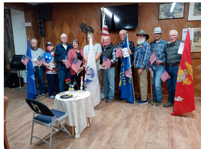
Englewood VFW Post #322 and VFW Auxiliary did a POW/MIA Missing Man Table Program at Wolhurst Mobile Home Park on November 12th with 10 Veterans present. They handed out 10 U S Flags and 26 Buddy Poppies.